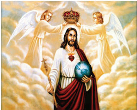
Christ the King